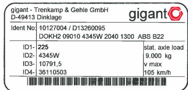
Figure 2: type plate from 09'2013

The scope of the new Test Reports now includes so-called “information documents”. These contain data on the axle, brake and the permissible distances between brake and wheels which is relevant for technical service.